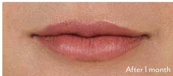
After 1 month

Ask us how you can get subtle, long-lasting results with JUVÉDERM VOLBELLA® XC.